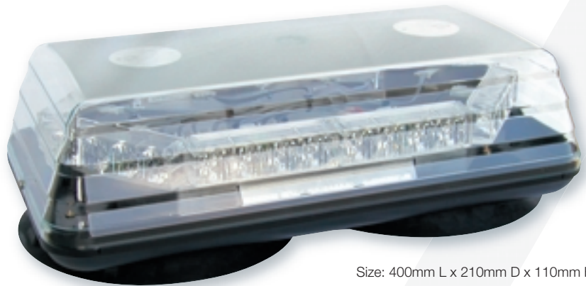
Size: 400mm L x 210mm D x 110mm H